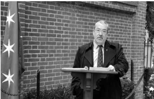
Images from the Birthday Wreath Laying