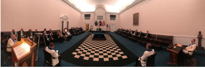
Above: AW22 – View from the East during a presentation before Lodge.