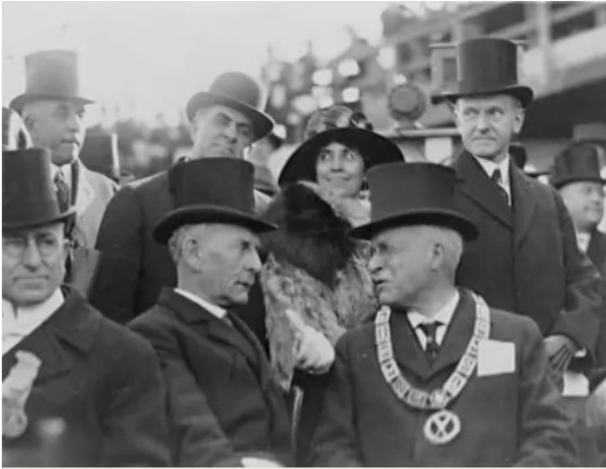
Below: President and Mrs. Coolidge at the laying of the cornerstone of the George Washington Masonic National Memorial.

For the past several months I have talked about the Medallion that the Lodge now has for sale to its members. I have now received payment of $25.00 from four brothers who live in Locations other than the Northern Virginia area and do not attend lodge to be able to pick up the medal when it is available. The problem is that the lodge is offering the Medallion for $25.00 which is the cost the lodge pays to the manufacturer for making the same. The cost to mail the Medallion is just short of $5.00. Accordingly, if you are ordering the Medallion and request it to be mailed to you, you need to make your payment for $30.00.