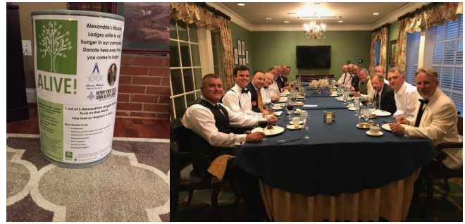
Collection bin for can goods. Awesome dinner and evening at the Army Navy Club