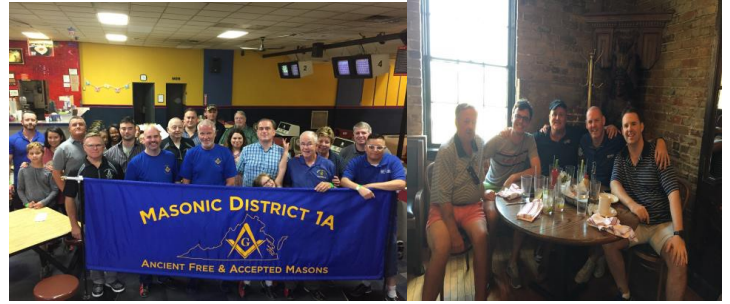
"Bowling for MAHOVA" District 1A event MMs at lunch after golfing