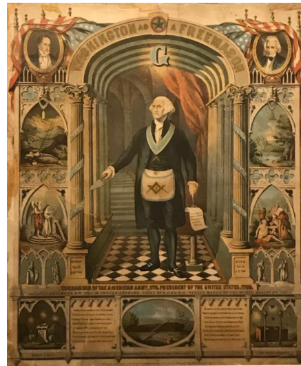
Photo 2: A poster from the George Washington Museum in the George Washington Masonic National Memorial, depicting him with masonic regalia and a trowel in his right hand. The Memorial offers tours throughout the day, which culminate with a 360 degree view of DC and Northern Virginia from the very top.