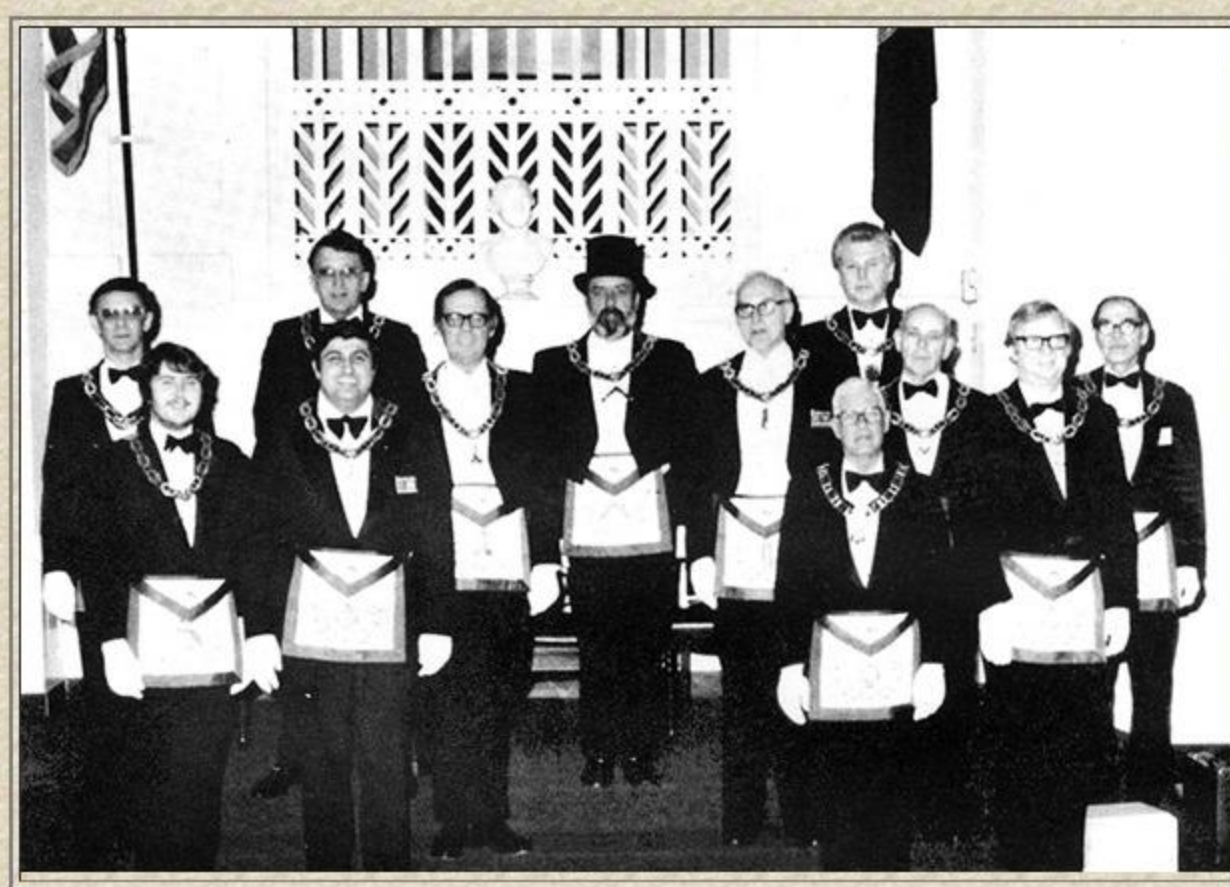
ALEXANDRIA-WASHINGTON LODGE NO. 22