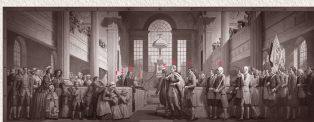
George Washington and Brethren in Saint John's Day Observance, Christ Church, Philadelphia, December 28, 1778