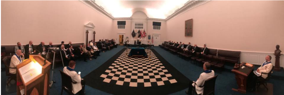
Above: AW22 – View from the East during a presentation before Lodge.

https://www.paypal.me/AlexWash22/31.20 ($25.00 for the Medallion, $5.00 for postage and $1.20 PayPal fee). Once your payment is received, you will be placed on the list to receive one of the next batch when they arrive. We do not plan to order more unless we receive a request and payment in advance.