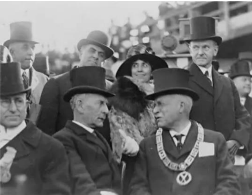
Below: President and Mrs. Coolidge at the laying of the cornerstone of the George Washington Masonic National Memorial.