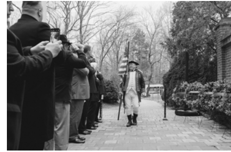
Present the Colors!