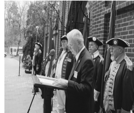
Our GM addresses everyone at the tomb