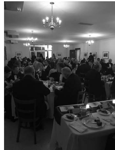
GW Birthday Celebration Banquet