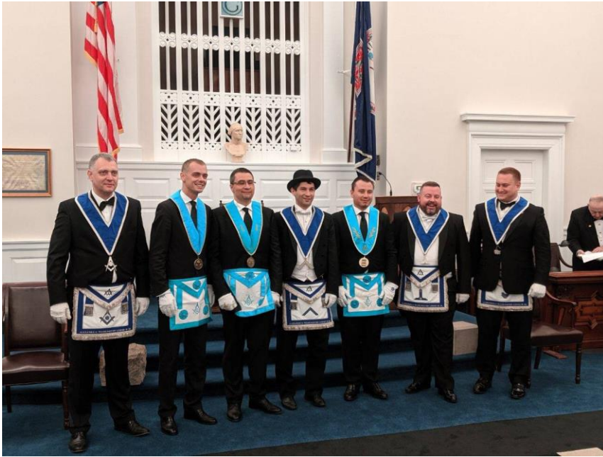
Photo 1: Having a good time after our May stated communication together with our visiting Brethren from Sgovor Lodge No. 101 who came to visit all the way from Sofia, Bulgaria.

Alexandria-Washington Lodge No. 22 will hold its traditional “The Feast of St. John the Baptist” Table Lodge on Monday, June 24, 2019, at 7:00 PM, at Gadsby’s Tavern, Old Towne, Alexandria, Virginia. The cost is $50.00 per attendee, and the seating is limited to about 50 to 60 personnel. This can be attended by Entered Apprentice and Fellow Craft Masons as well as Master Masons.