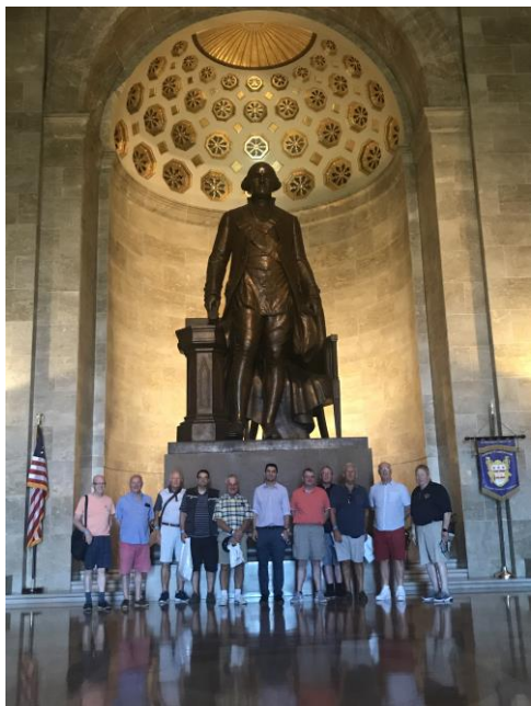
Photo 2: Taking our Brethren from the Provincial Grand Lodge of Mark Master Masons of Kent, England for a tour of the George Washington Masonic National Memorial and AW22.

https://www.paypal.me/AlexWash22/20.91 This will cover the $20.00 ticket plus the $0.91 fee PayPal charges to use their system. The ticket(s) will be mailed back to you.