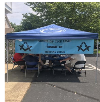
Cigar Herf Tent with banner