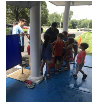
Lining up for water balloons

On Saturday, June 30, District 1A, 54 and Elmer Timberman Lodge from 1B came together for a joint picnic. In 2019 all 3 entities will become one district – Masonic District 1A.