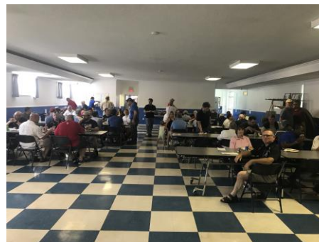
Some chose inside for eating at the picnic