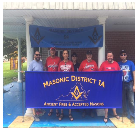
Picnic Committee with 1A&54 banners